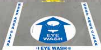
Eye Wash Kit