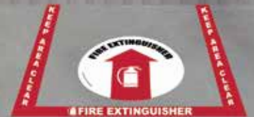
Fire Extinguisher Kit