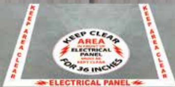
Electrical Panel Kit