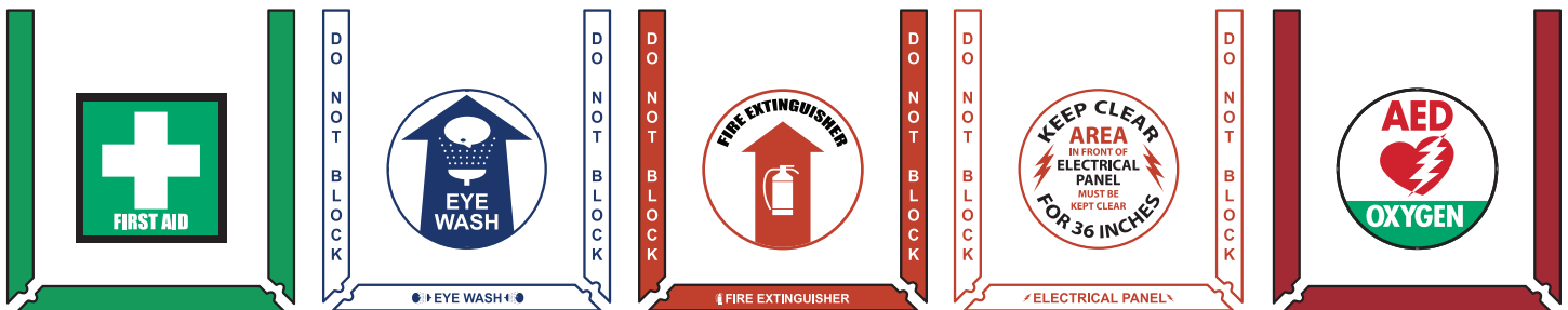
First Aid Kits