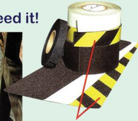
All colors available in standard roll sizes or die cut shapes